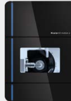
ceramill® motion 2