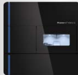
ceramill® mikro ic