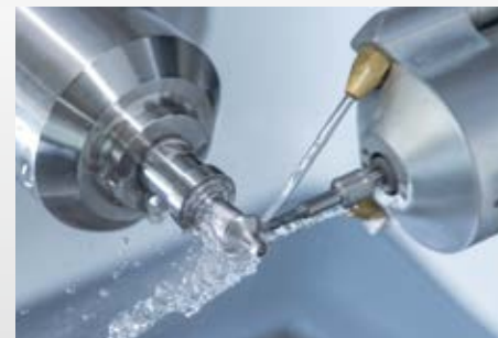
Processing a Ceramill TI-Forms using rotational milling