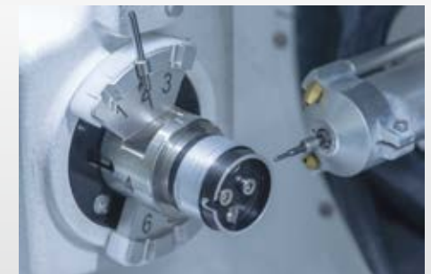
Precision calibration ensures correct alignment of the abutment and implant connection geometry